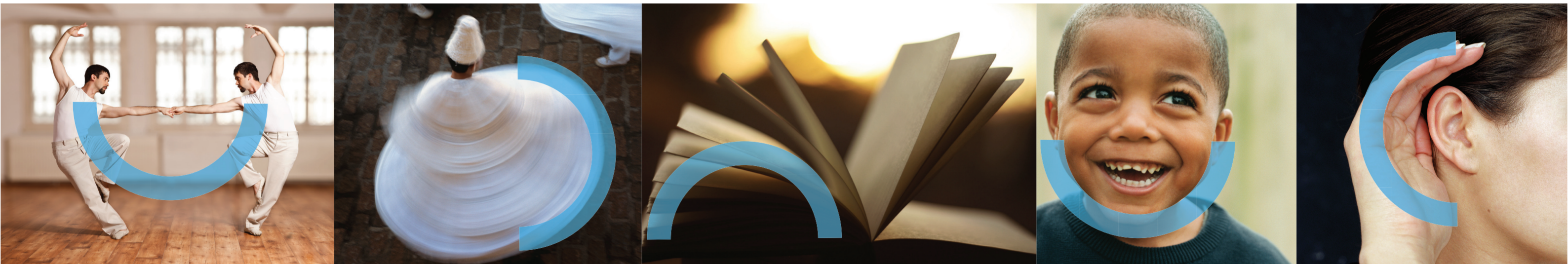
OPEN TO ... VARIETY