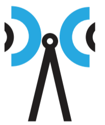
MEDIA & COMMUNICATION